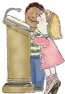
Children's Worship Service

Enjoy their singing, their speaking, and their insights as they worship God and celebrate what it really means for all of us to be "Children of God."